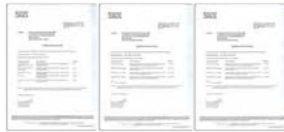
Certificate of SGS

Aii-DNA Tested, Certificated That DEER PLACENTA : "No Hormones", "Steroid Free" "No Microbacterium" and "No Metals" It Is A Safe And Healthy Product.