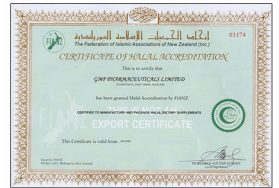
Halal Accreditation by FIANZ New Zealand