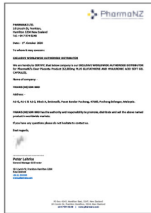
Global exclusive agency authorization letter